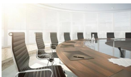
Small Meeting room